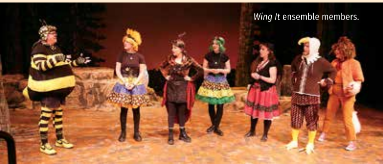
Wing It ensemble members.